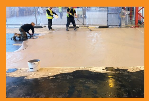
Further images are featured on the following page.

Initially, Zenith's team commenced works by grinding the entire floor area, measuring some 1650 m2, to remove all existing coatings and applying Deckaflix grouting to some of the more pitted areas. Once the surface was level, they were able to apply Deckmaster HFS UVR, a 1.5mm trowel-applied, flexible polyurethane system, designed specifically to go on asphalt substrates.