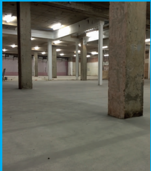
The finished floor for Primark