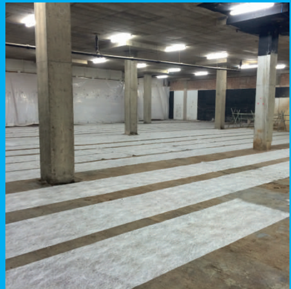
Mesh was rolled out and Uzin NC 160 pumped in.