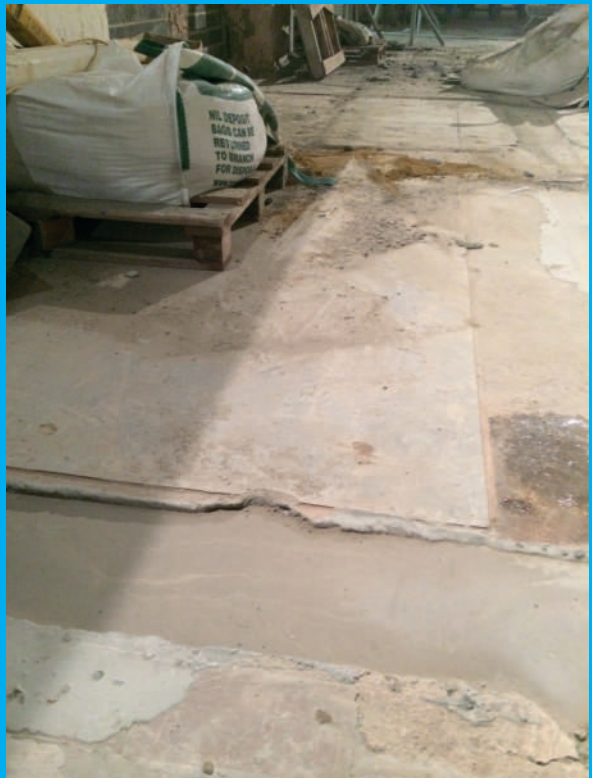
Channels were backfilled and level differences ramped down.