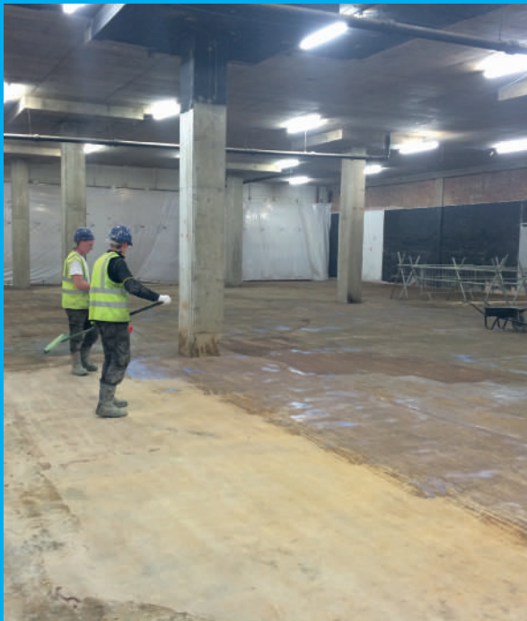
Uzin's PE 360 primer was applied to the first floor.