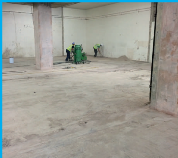
Existing state of the screed was extremely poor.