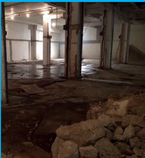
Leaking pipes and water ingress posed constant problems throughout the installation process.