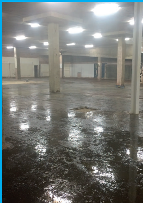
Uzin's PE 480 DPM was applied to the ground floor.