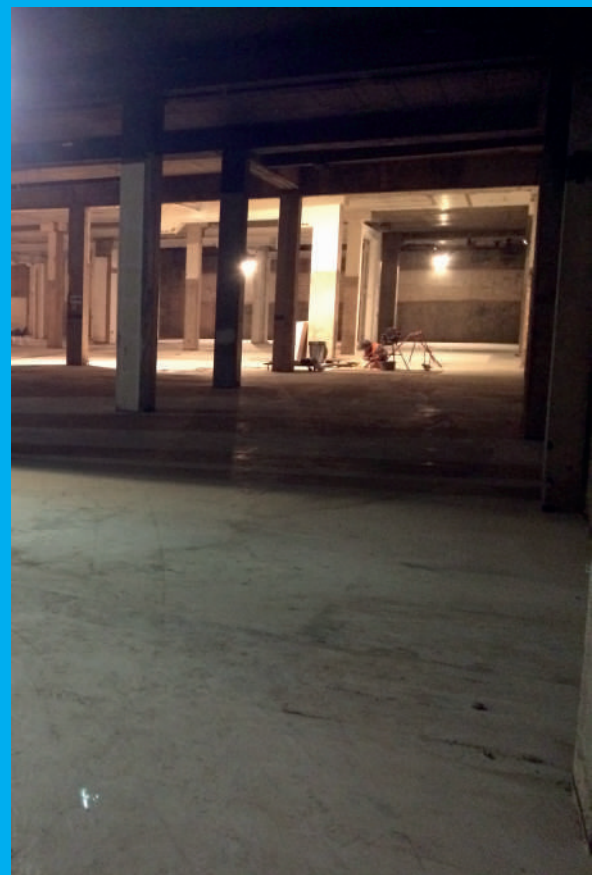
The finished floor for Next.