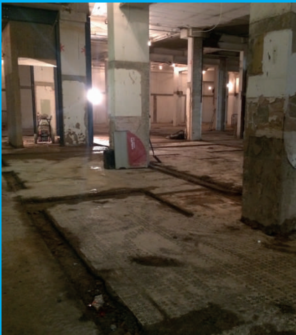
Level differences and channels in the existing floor called for a high level of preparation.