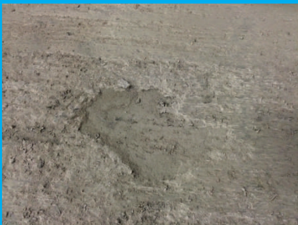
The project called for a specialist, failsafe flooring solution, capable of going over a weak substrate covered with latex, adhesive residue and wet areas.