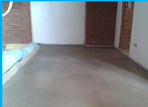
Screed in curing process in the Throne Room